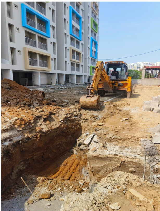
Crossing in C3- Block

External Sewerage Lines : Excavation for Road crossing in C3 Block & Excavation in between B1 & B2 block for laying of Eco-drain pipes on Progress