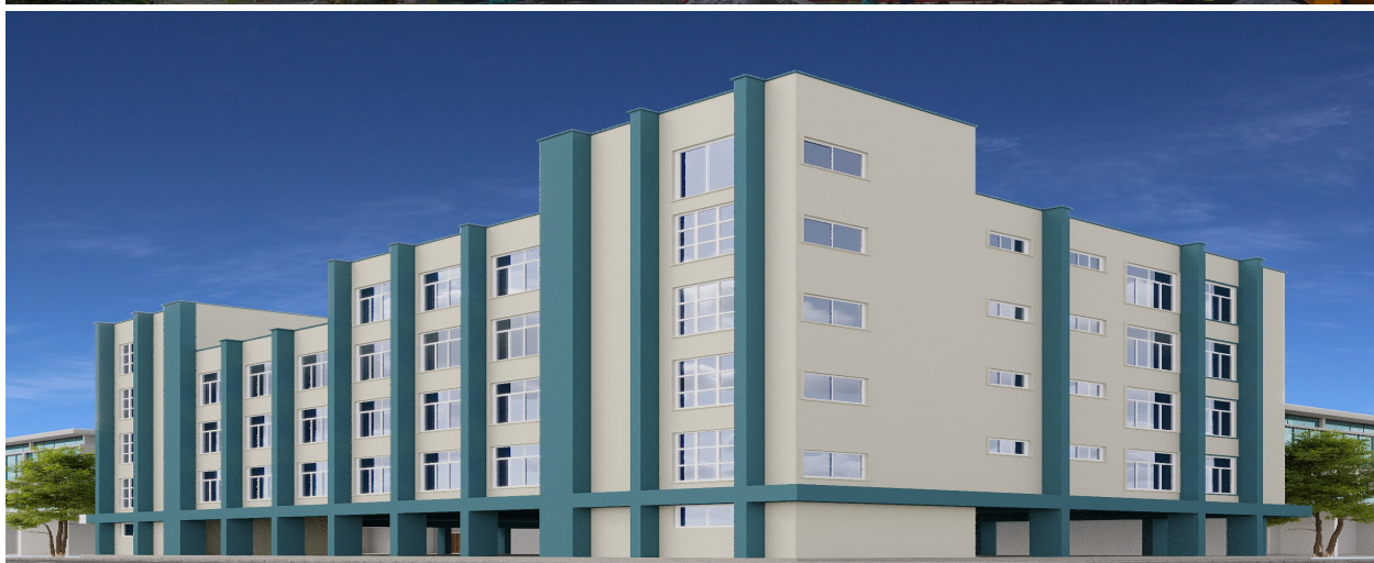
Proposed New Colour for Community Hall