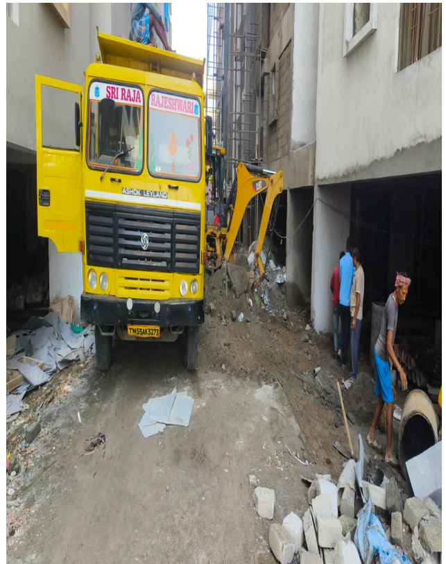
In Between B1 & B2 Block