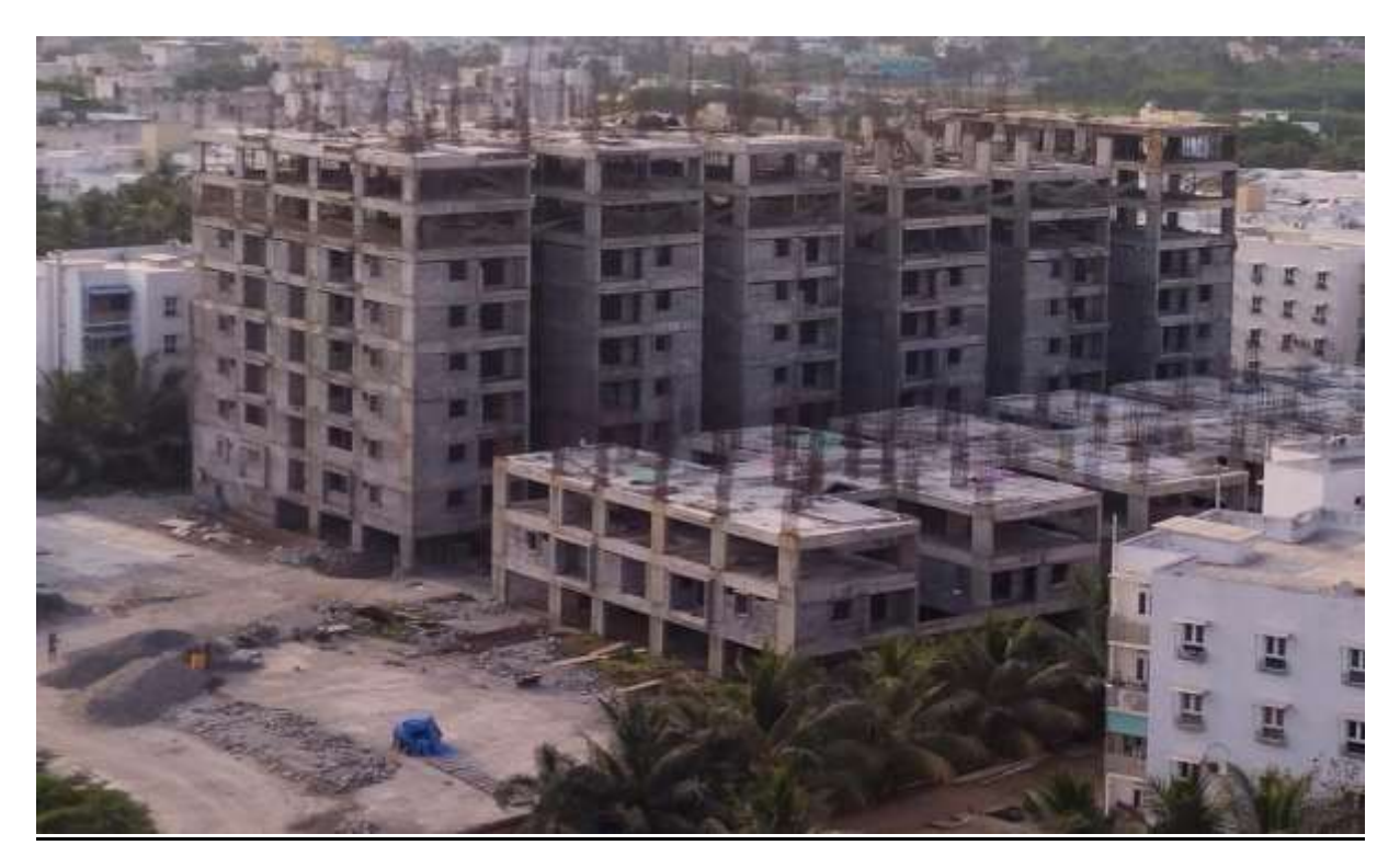
View of C1 Block, C2 Block & C3 Block