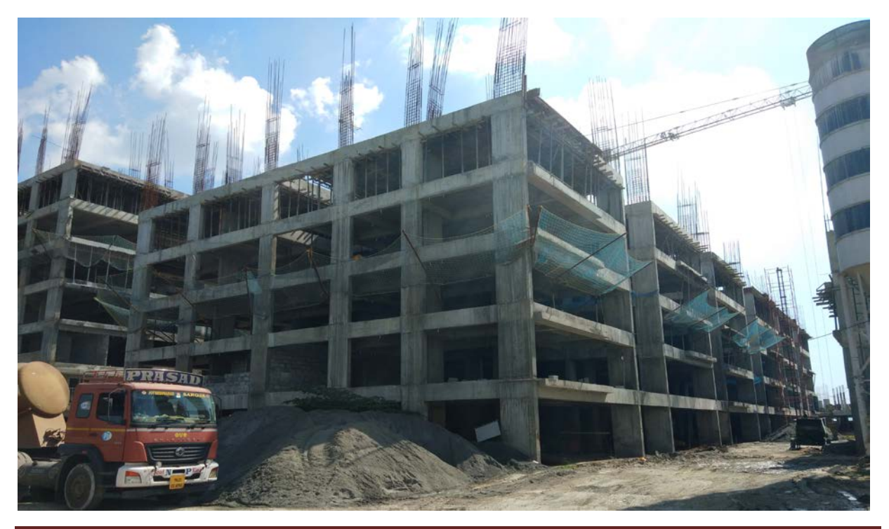
Block C2: Fifth Floor level slab 1<sup>st</sup> Half concrete completed and in 2<sup>nd</sup> Half shuttering & barbending works 85% completed.

Block C1: Seventh Floor level slab 1<sup>st</sup> half concrete completed. Barbending works are on progress for columns upto Eight floor.