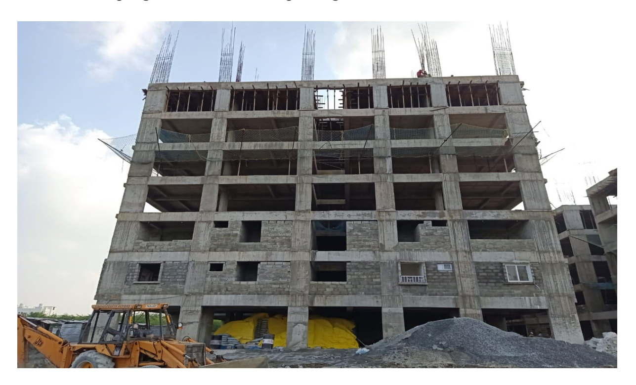
Block C2: Fifth Floor level slab 1<sup>st</sup> Half concrete completed and in 2<sup>nd</sup> Half shuttering & barbending works 85% completed.

Block C1: Seventh Floor level slab 1<sup>st</sup> half concrete completed. Barbending works are on progress for columns upto Eight floor.