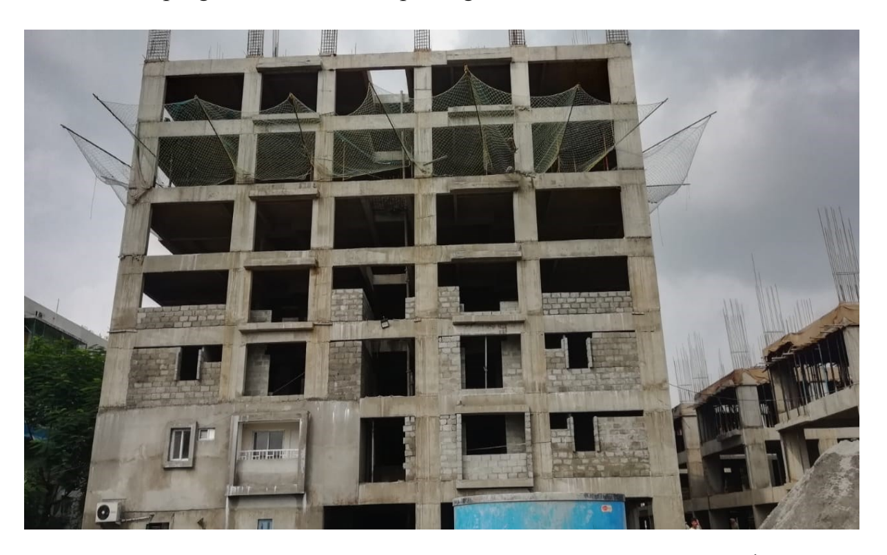
Block B2: Third Floor Level slab concrete 1<sup>st</sup> Half completed & in 2<sup>nd</sup> half floor Shuttering & Barbending works 80% completed.

Block B1: Seventh Floor Level slab concrete 100% completed. Barbending works are on progress for columns upto Eight floor.