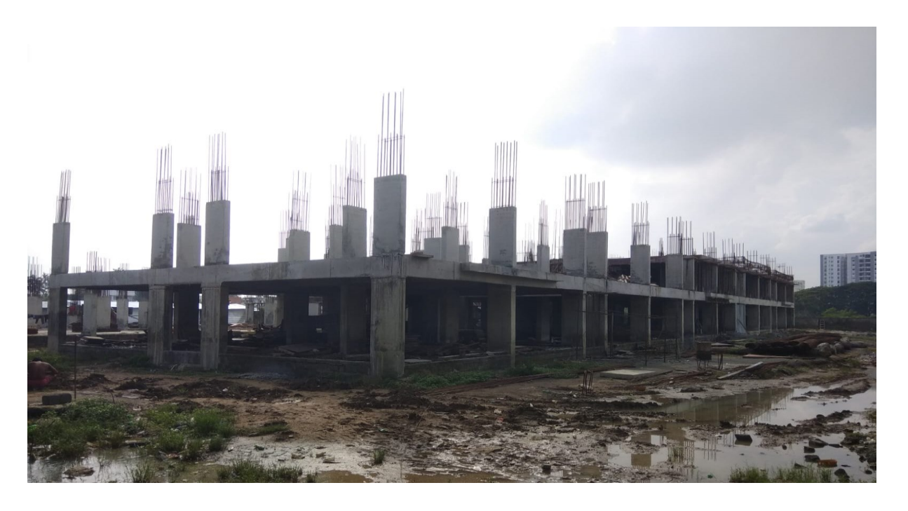
Block A2: First Floor level slab concrete 1<sup>st</sup> Half completed & in 2<sup>nd</sup> half beam bottom shuttering work on progress.

Block A1: First Floor Columns concrete 100% completed. Second Floor level slab 1<sup>st</sup> Half Shuttering & Barbending works 45% completed.