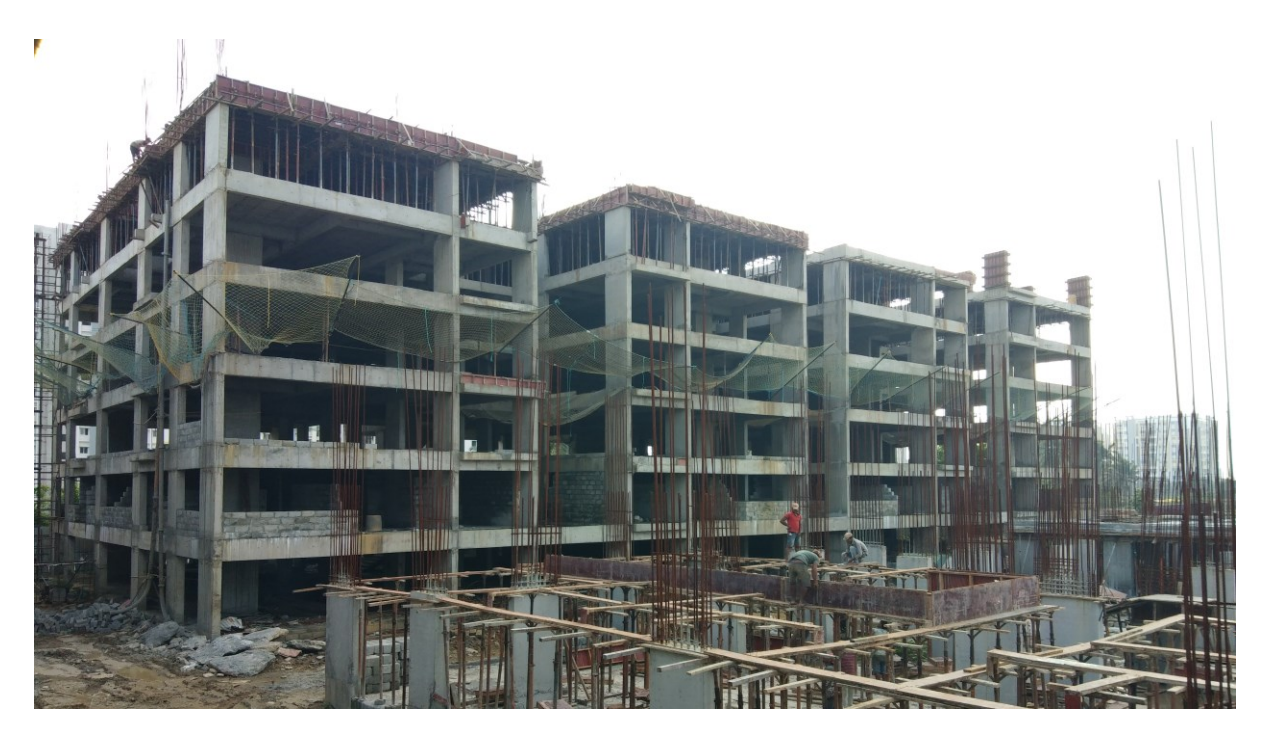
Block D3: Fourth Floor Level slab 1<sup>st</sup> Half concrete completed and for 2<sup>nd</sup> half columns concrete work 90% completed.

Block D2 : Sixth Floor Level slab 1^{\rm st} Half concrete completed and for 2^{\rm nd} half Shuttering & barbending works 85% completed.