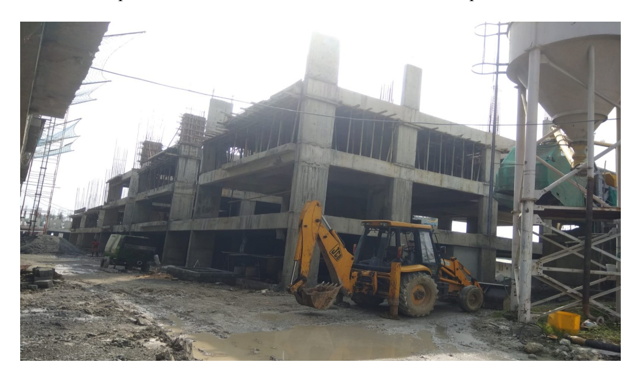
Block D1: First Floor Level slab 1<sup>st</sup> Half concrete completed and for 2<sup>nd</sup> half barbending works are on progress

Block C3: Second Floor Level slab 1<sup>st</sup> Half concrete completed and in 2<sup>nd</sup> half shuttering & barbending works 60% completed. Third Floor Level slab 1<sup>st</sup> Half concrete completed & third floor columns concrete 20% completed.