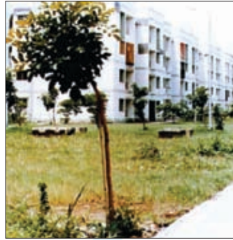
Nerul : 384 DUs Completion Year : June, 1996