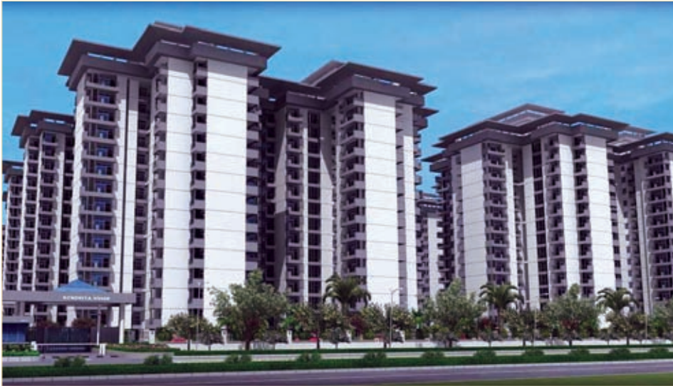
Greater Noida Artistic I