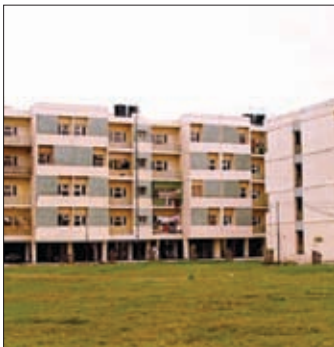
Kolkata, Ph-I : 576 DUs Completion Year : October, 1997