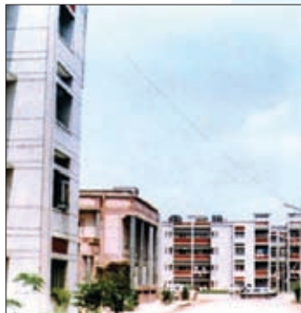
Noida, Ph-II : 508 DUs Completion Year : September, 1998