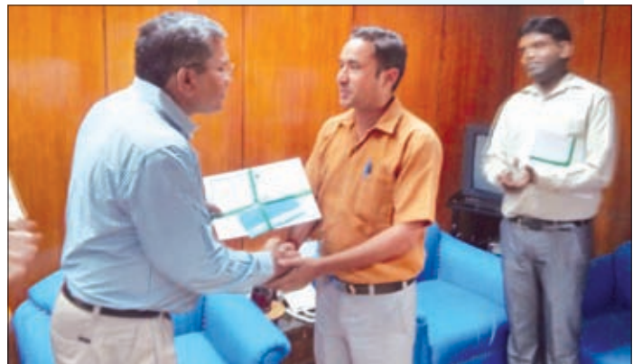
Hindi Week Celebration and Prize Distribution, September 2015