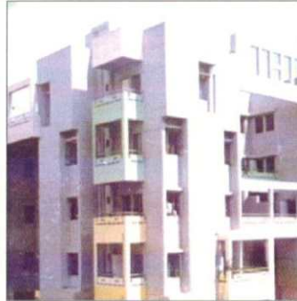
Ahmedabad : 310 DUs Completion Year : October, 2005