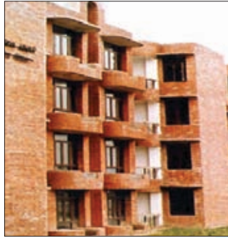
Panchkula, Ph-I : 98 DUs Completion Year : January, 1997