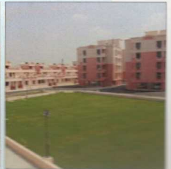
Lucknow, Ph-I : 130 DUs Completion Year : August, 2008