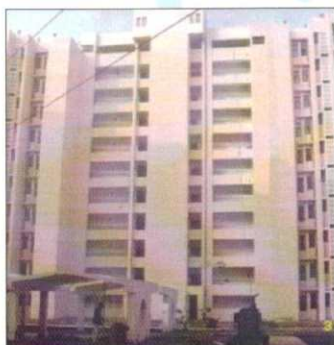
Mohali, Ph-I : 630 DUs Completion Year : April, 2013