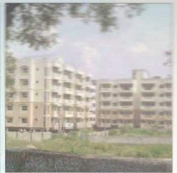
Hyderabad, Ph-II : 380 DUs Completion Year : October, 2012