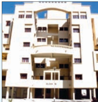
Hyderabad, Ph-I : 344 DUs Completion Year : July, 2001