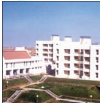
Pune, Ph-I : 159 DUs Completion Year : January, 2003