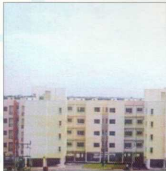
Chennai, Ph-II : 572 DUs Completion Year : February, 2012