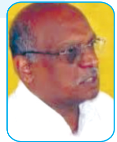
Sh. KKN Kutty National Council (JCM), Member GB/GC