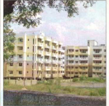
Hyderabad, Ph-II : 178 DUs Completion Year : February, 2006