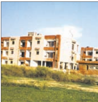
Chandigarh : 305 DUs Completion Year : May, 2000