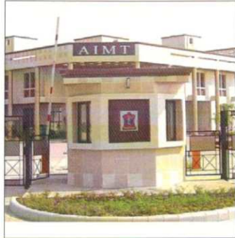
AIMT, Ph-I : Completion Year : March, 2005