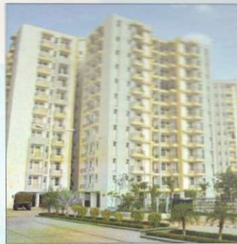
Jaipur, Ph-II : 572 DUs Completion Year : March, 2012