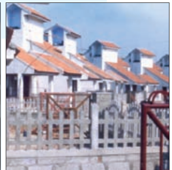
Kochi : 43 DUs Completion Year : June, 2011