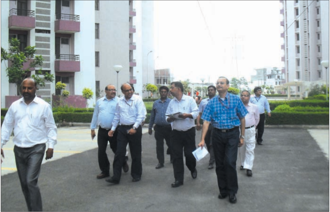
Visit of Joint Secretary (Housing) Ministry of Housing and Urban Poverty Alleviation, Govt. of India and Chairman Executive Committee, CGEWHO to Mohali Project on 19.05.2015