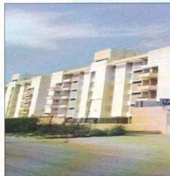
Meerut, Ph-I : 90 DUs Completion Year : December, 2013