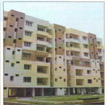
Kolkata, Ph-II : 582 DUs Completion Year : November, 2014