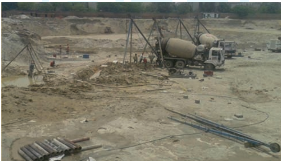
Greater Noida. Piling Works in Progress. Actual Photograph