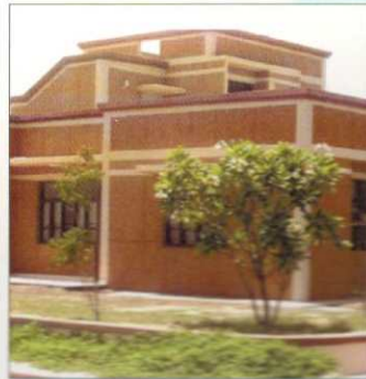
AIMT, Ph-II : Completion Year : March, 2007