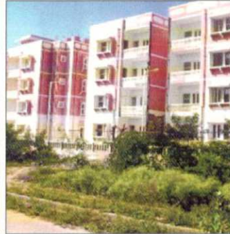
Jaipur, Ph-I : 184 DUs Completion Year : October, 2005