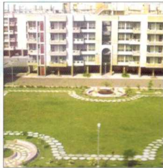
Noida, Ph-V : 576 DUs Completion Year : March, 2007