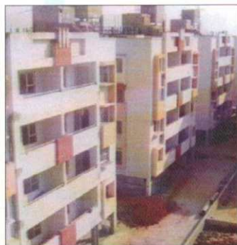
Bhubaneswar, Ph-I : 256 DUs Completion Year : January, 2013