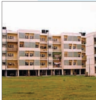
Noida, Ph-III : 980 DUs Completion Year : December, 2003