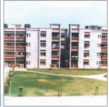
Noida, Ph-I : 692 DUs Completion Year : September, 1997