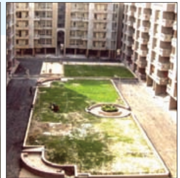
Noida, Ph-IV : 720 DUs Completion Year : February, 2005