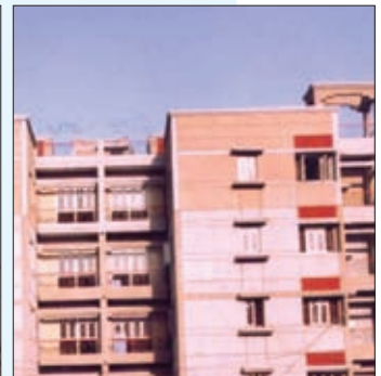
Gurgaon, Ph-I : 1088 DUs Completion Year : July, 1999