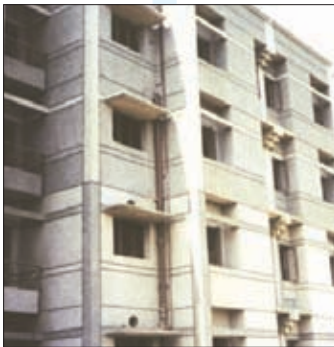
Gurgaon, Ph-II : 852 DUs Completion Year : September, 2002