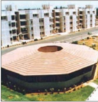
Chennai, Ph-I : 524 DUs Completion Year : October, 1995