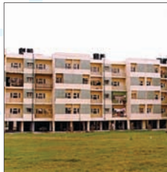
Bangalore : 603 DUs Completion Year : March, 2001