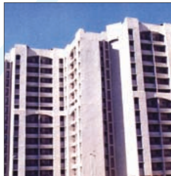
Kharghar : 1230 DUs Completion Year : September, 1998