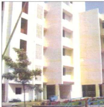
Pune, Ph-II : 148 DUs Completion Year : December, 2008