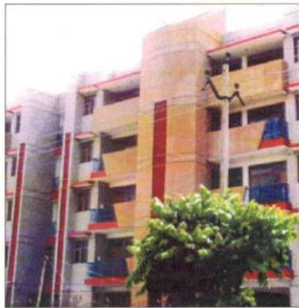
Panchkula, Ph-II : 240 DUs Completion Year : July, 2006