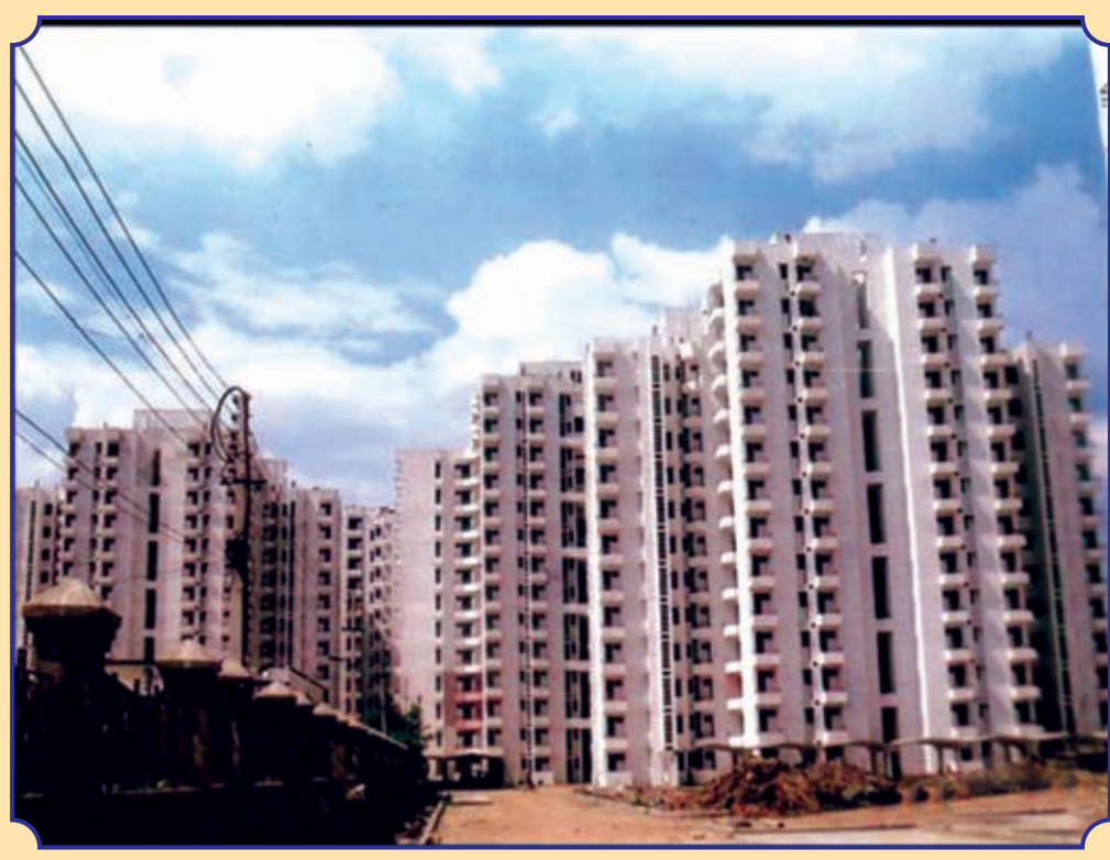
Mohali Ph II