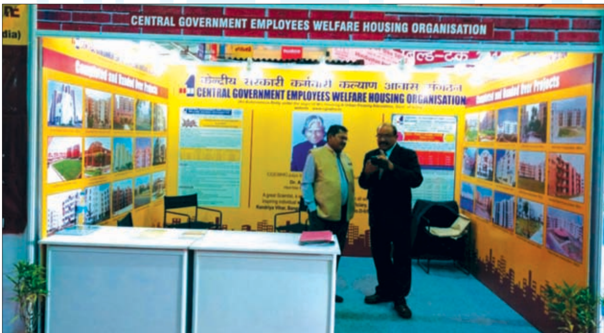
CGEWHO Participation in India International Trade Fair 2015