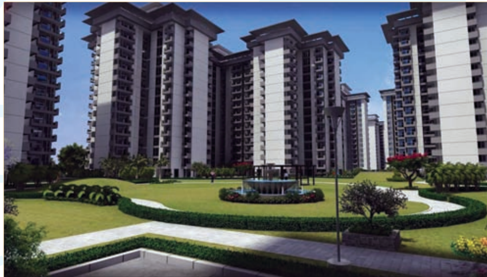
Greater Noida Artistic II