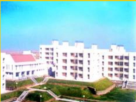
Pune (Phase-I) Housing Scheme : 159 Flats