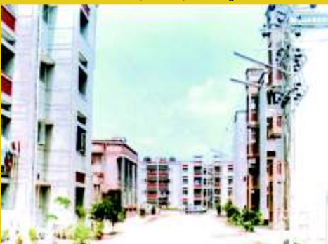
Noida (Phase-I) Housing Scheme 692 Flats