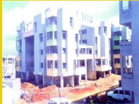
Ahmedabad Housing Scheme : 74 Flats