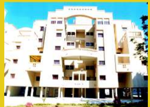
Hyderabad (Phase-I) Housing Scheme : 344 Flats