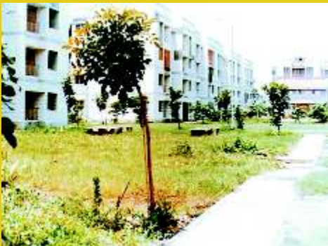
Nerul, New Bombay Housing Scheme : 384 Flats