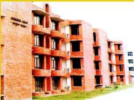
Panchkula (Phase-I) Housing Scheme : 98 Flats