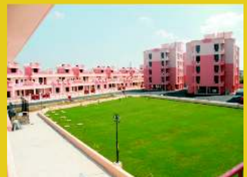
Lucknow (Ph-I) Housing Scheme : 130 Flats