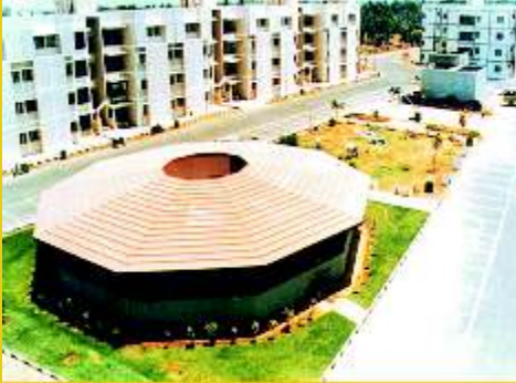
Chennai (Phase-I) Housing Scheme : 524 Flats