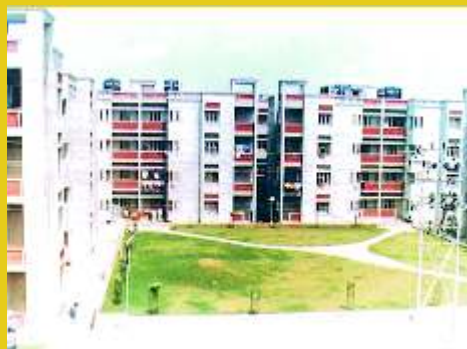
Noida (Phase-II) Housing Scheme : 508 Flats