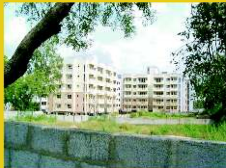
Hyderabad (Phase-II) Housing Scheme : 178 Flats