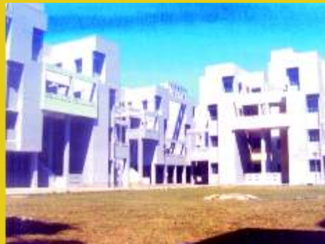
Housing Scheme for Comptroller Auditor General of India at Ahmedabad : 281 Flats