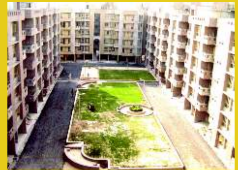
Noida (Phase-V) Housing Scheme 576 Flats