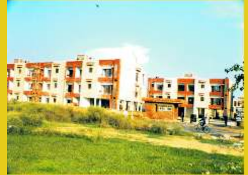
Chandigarh Housing Scheme : 305 Flats