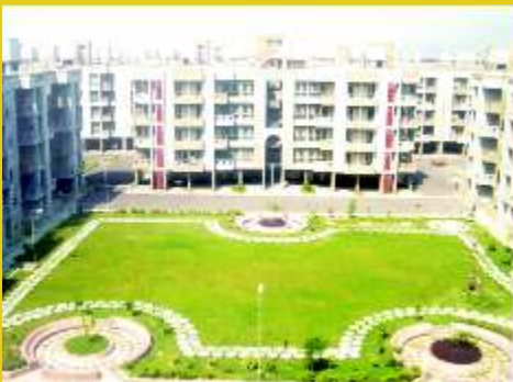
Noida (Phase-IV) Housing Scheme : 720 Flats