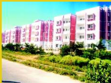
Jaipur (Phase-I) Housing Scheme : 184 Flats