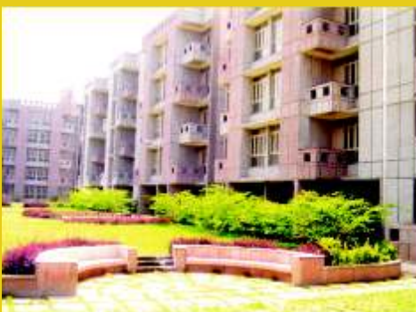
Noida (Phase-III) Housing Scheme : 980 Flats