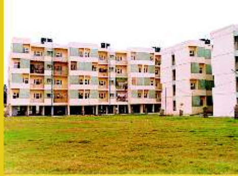
Kolkata (Phase-I) Housing Scheme : 576 Flats