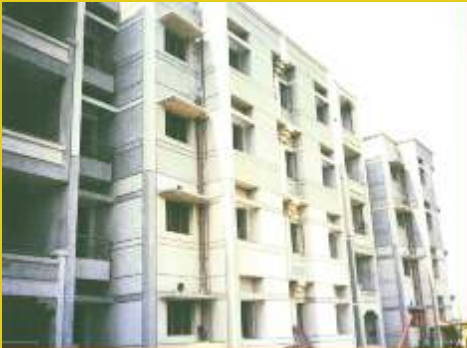
Gurgaon (Phase-II) Housing Scheme : 852 Flats