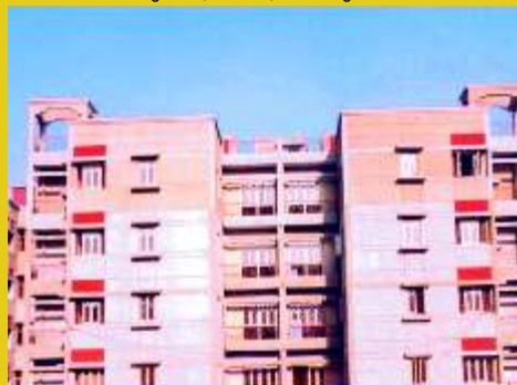
Gurgaon (Phase-I) Housing Scheme : 1088 Flats