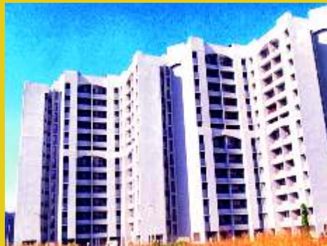
Kharghar, Navi Mumbai Housing Scheme : 1230 Flats