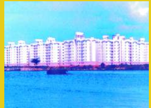
Bangalore Housing Scheme : 603 Flats