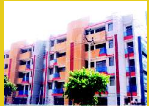
Panchkula (Phase-II) Housing Scheme : 240 Flats